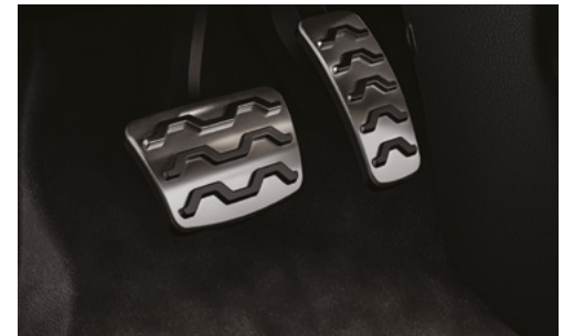
Stainless steel pedals