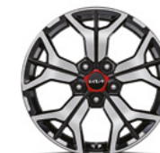
215 / 60 R17" (GT Line)