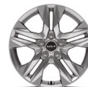
215 / 60 R17" (EX+)