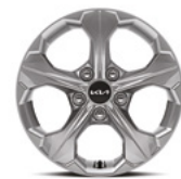
205 / 65 R16" (EX)