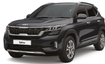
Aurora Black Pearl