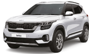
Glacier White Pearl