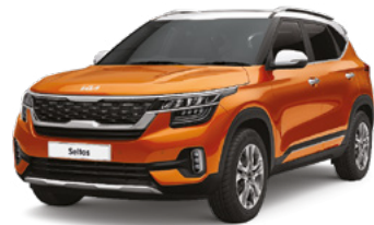
Roof: Clear White Body: Punchy Orange **