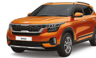
Punchy Orange **