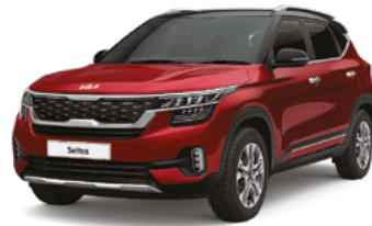
Roof: Aurora Black Pearl Body: Intense Red *