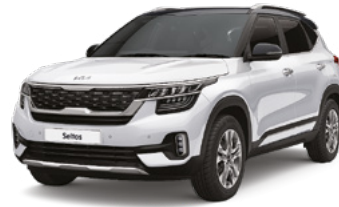
Roof: Aurora Black Pearl Body: Glacier White Pearl *