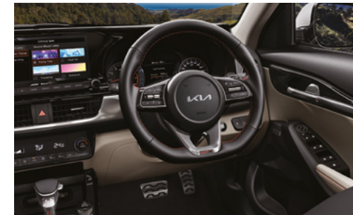
D-cut steering wheel